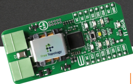
FT Click: mikroBUS compatible free topology (FT) module