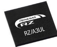
361-pin, 13x13mm PBGA (0.5mm pitch)

The RZ/A3UL delivers significant performance, including the highest operating frequency of 1GHz and the ability to connect to high-speed DDR3L/DDR4 RAM. In addition to its high-performance features, RZ/A3UL is an entry-class device providing a cost-effective solution for HMI, IoT Gateway, and audio equipment.