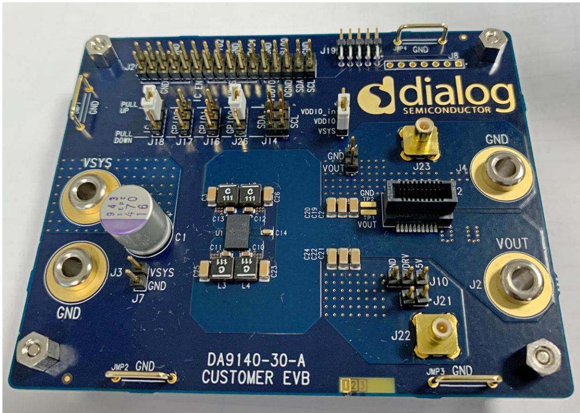
Figure 1: DA9140-30 Customer Evaluation Board

The DA9140-30-A evaluation board enables evaluation of the DA9141 PMIC.