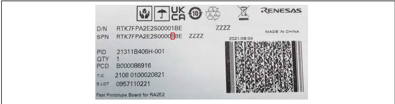
Figure 2. Identification of the Kit Version Number on the FPB-RA2E2 Kit Packaging

The kit version can be found on the FPB-RA2E2 kit packaging label as described in this section. The kit version is the last digit in the orderable part number as shown in Figure 2. In the following example the kit version number is “1”.