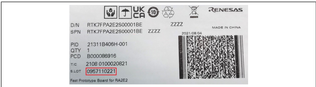
Figure 3. Identification of the Serial Number on the FPB-RA2E2 Kit Packaging

The serial number is located on the packaging label identified as S.LOT and on the serial number sticker on the back/bottom side of FPB-RA2E2 board. In the example in Figure 3 and Figure 4, the serial number is “0957110221”.