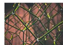
Courier Databinding and Messaging Framework