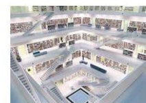
Asset Library Shaper Splitting Assets for Optimization