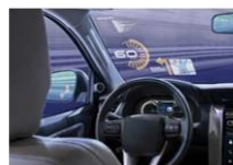
Warping (optional HUD Windshield Warping)