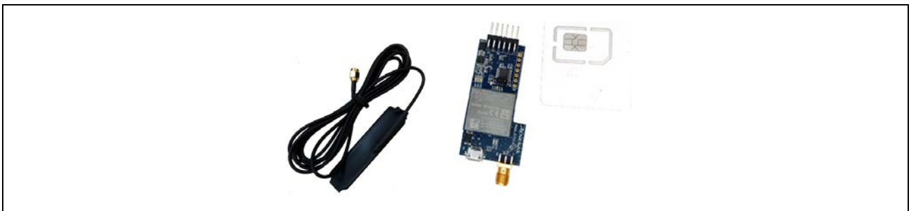
Figure 1. Kit Contents