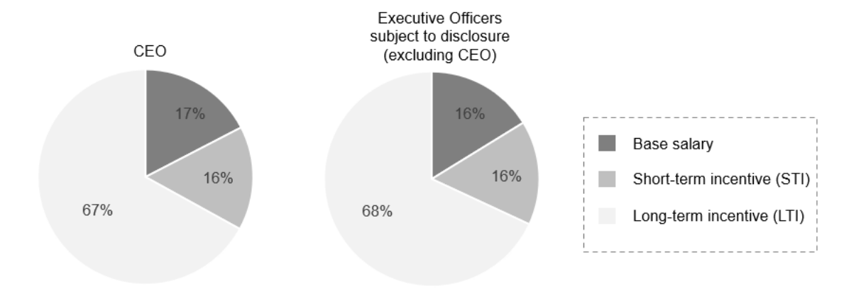
(Note) Each compensation element is based on a target base amount before reflecting performance (as of December 31, 2022)

The percentage of the variable portion is greater than the current general situation of executive compensation in Japan because it rewards Executive Officers for company performance and individual performance.