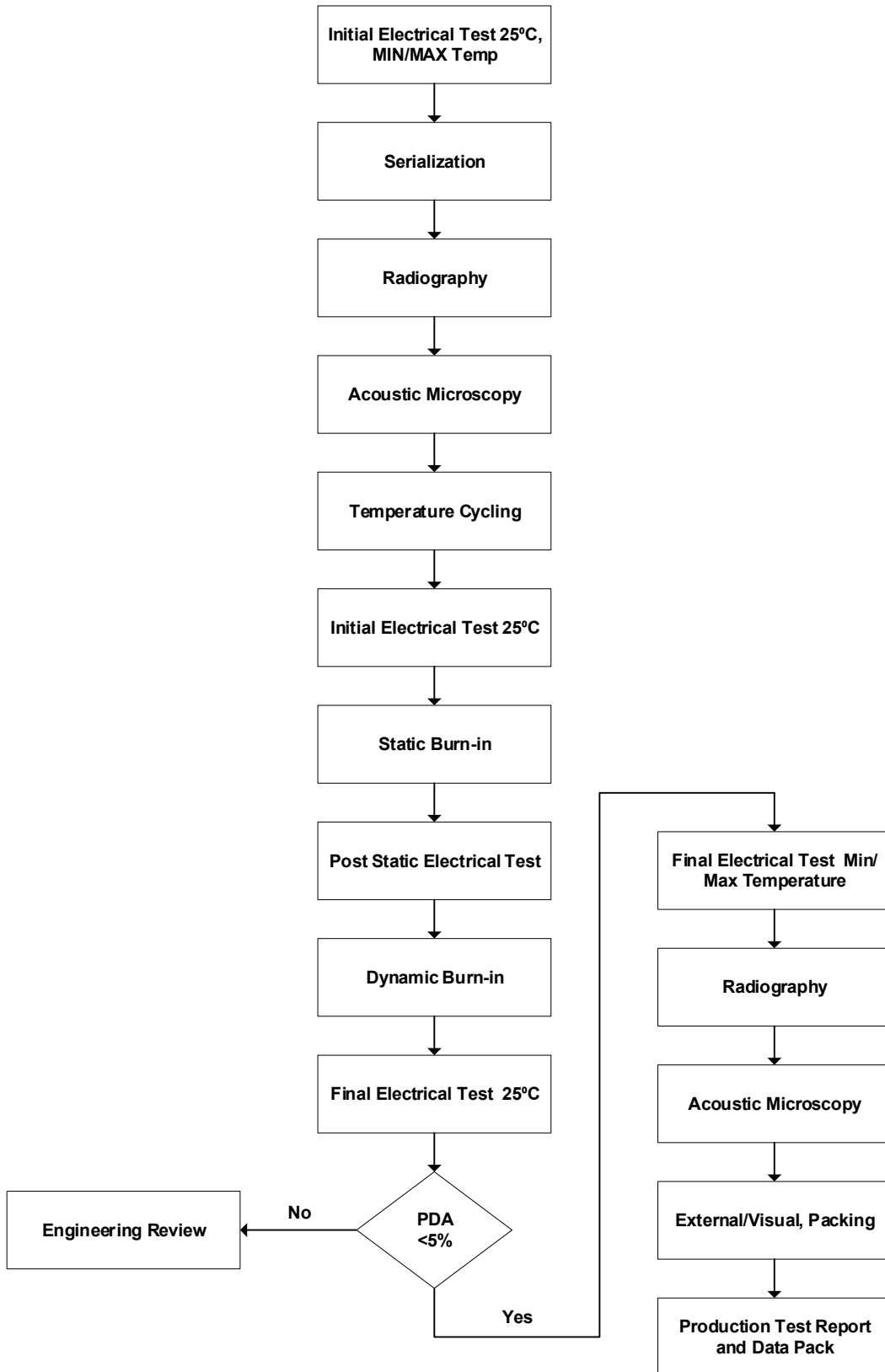
Figure 1. Flow Chart

This section outlines the production flow that 100% of the radiation hardened plastic products receive. This testing flow aligns with industry accepted standards including SAE AS6294/1 and NASA PEMS-INST-001.