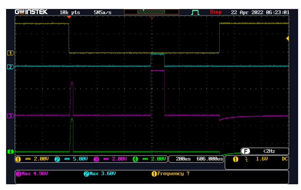
Figure 6 Glitch at HV_GPOx, decay = 1 (Slow decay)