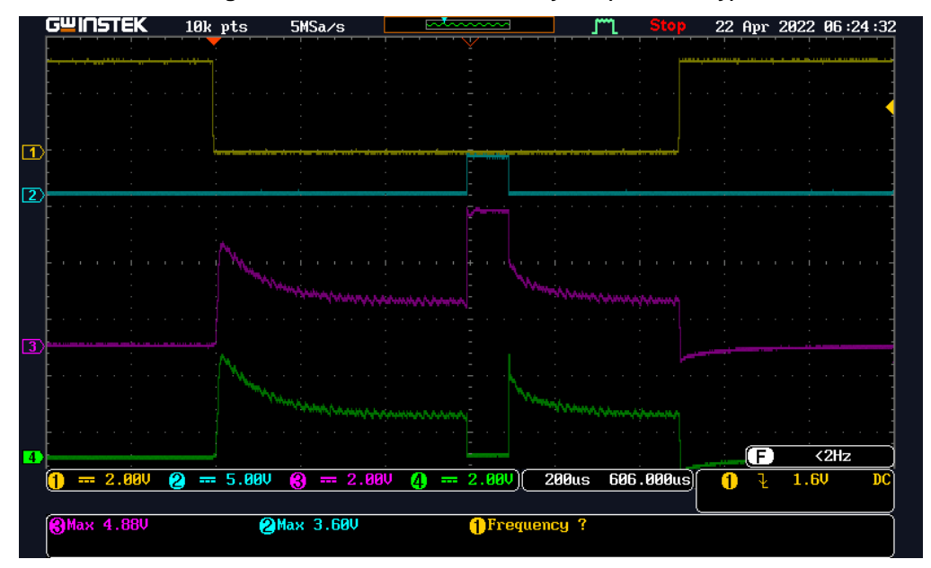
Figure 7 Glitch at HV_GPOx, decay = 0 (Fast decay)