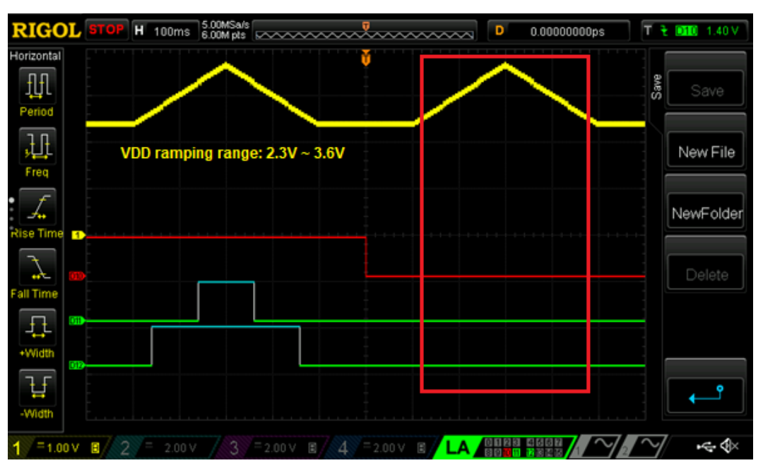
Figure 2 ACMPs Output Behavior