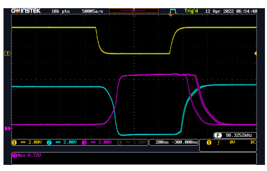
Figure 4 Shifted falling edge