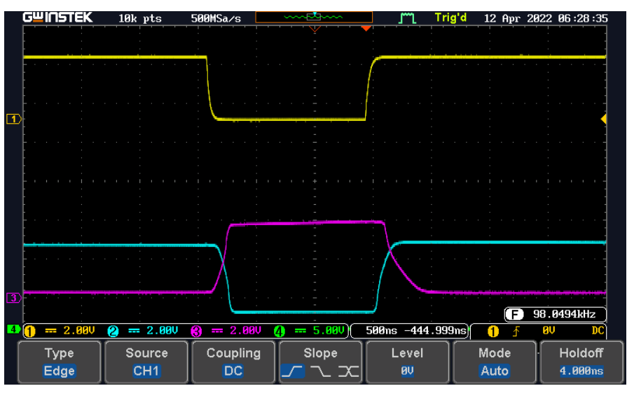
Figure 3 Normal operation

Channel 3 (magenta/third line) - HV_GPO1