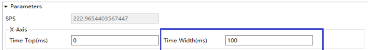
Figure 3 Setting of the X-axis Time Width