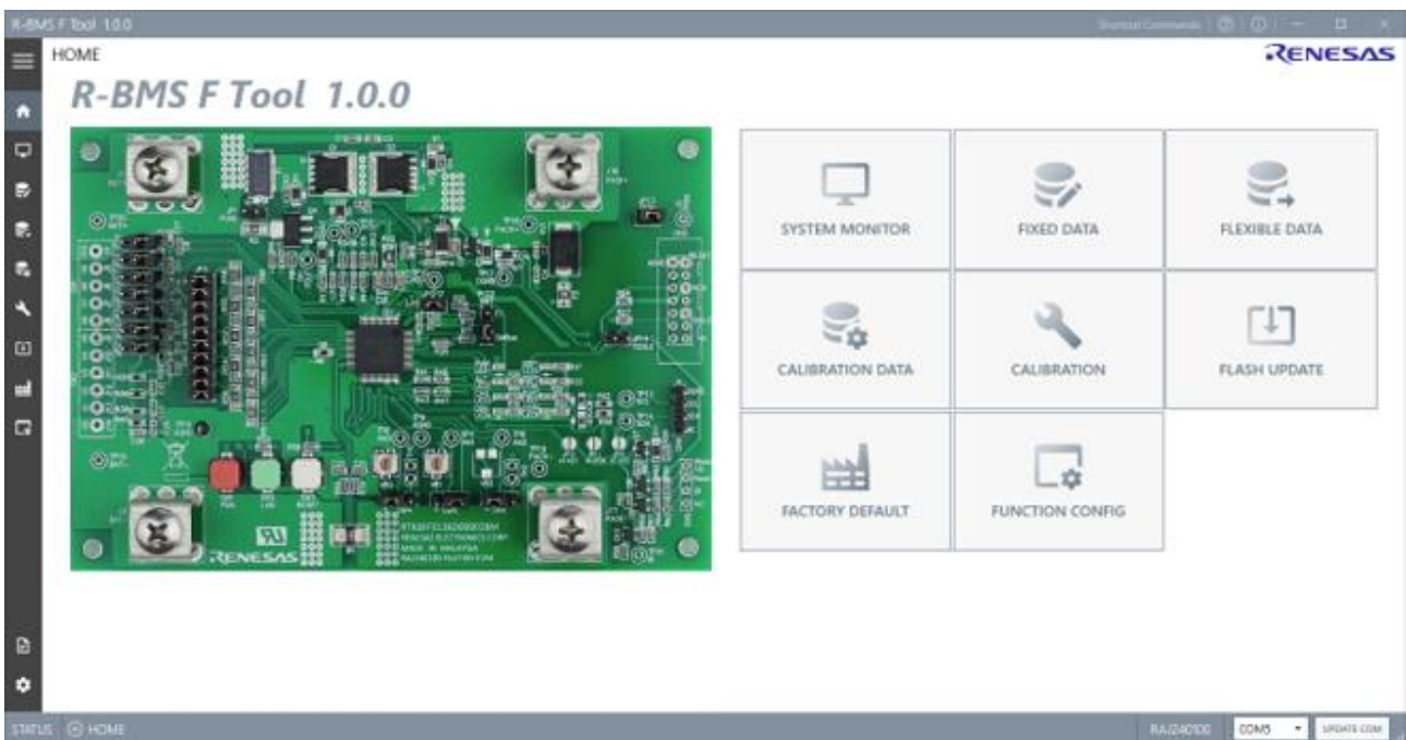
Figure 3-1 R-BMS_F_TOOL Overview