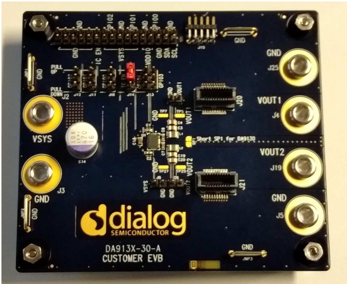
Figure 1: DA913x-30 Evaluation Board

The DA913x-30-A Customer Evaluation board referred below as "EVB" enables the measurement and evaluation of the DA9130/DA9131/DA9132 PMIC.