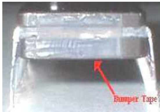
Figure 2: New material - Bumper tape