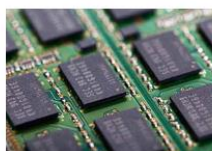
Memory Manager Memory Pool Definition