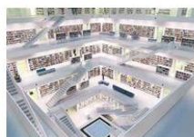
Asset Library Shaper Splitting Assets for Optimization