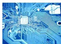
CGI Statemachine (or optional Statemachine Connectors)