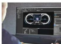
Scene Composer 2D/3D Authoring