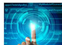
CGI Player Simulation