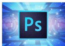
Smart Photoshop Importer AI detection algorithm technologies