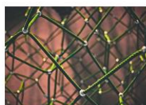
Courier Databinding and Messaging Framework