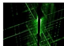
Candera 2D/3D Embedded Graphics Render Engine