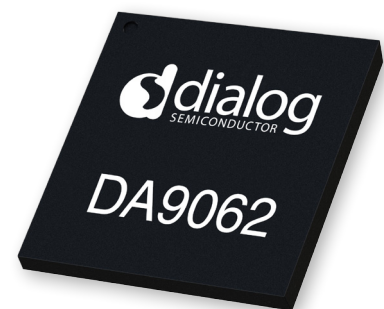
Available in QFN40, 6 mm x 6 mm, 0.5 mm pitch package consumer and automotive grades

DA9062 is also available as an automotive AEC-Q100 Grade 3 version.