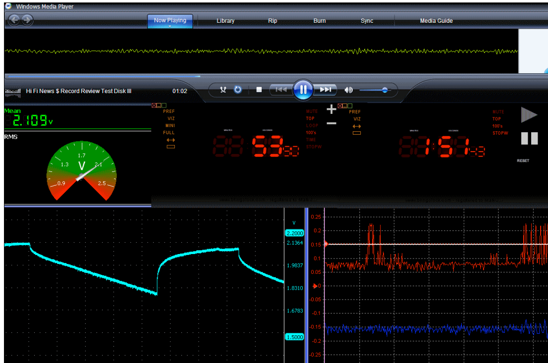
Fig1: Screenshot of Dialog's DA7210 Class G-ClassAB discharge demo suite

A screengrab of this setup is shown below. The voltage meter and discharge is shown in the left hand panes, on the bottom right pane the oscilloscope shows one headphone channel output (blue) and the corresponding Class G positive rail (red). The timers capture the supply capacitor discharge from approximately 2.1V to 1.85V.