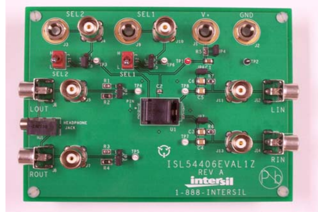
FIGURE 1. ISL54406EVAL1Z EVALUATION BOARD