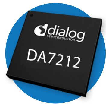
34 ball WL_CSP Package, 0.5mm pitch

Digital audio transfer to and from the external processor is available via bidirectional I2S interface which supports all common sample rates.