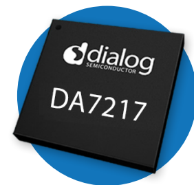
32 ball WLCSP package, 0.5 mm pitch

DA7217 contains two analog microphone input paths, or up to four digital microphone input paths, or a combination of both. The other chip in this family, the DA7218, has single-ended headphone outputs, and has been designed with headphone detect for use in accessories.