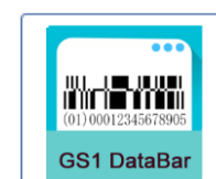
GR-GS1 DataBar Encoder/Decoder