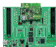
DA14695 Development Kit-Pro